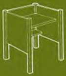
Single Faced Workstation TB-2836-WS TB-2848-WS