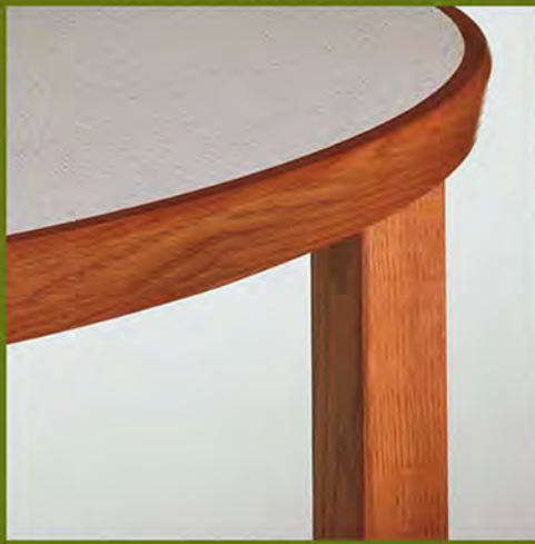
Teres B Series beveled edgeband