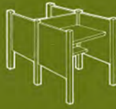
Double Faced Workstation TB-2836-DWS TB-2848-DWS