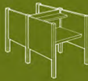
Double Faced Carrel initial/ladder TB-2436-DSC TB-2448-DSC