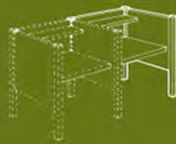
Single Faced Carrel initial/ladder TB-2436-SC-A TB-2448-SC-A