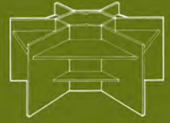
Full Hex O.P.A.C. Carrel TB-096-HCT