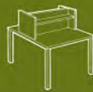
Double Faced Center Panel Carrel Table TB-4836-CP