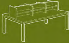
Double Faced, Double Tier Index table TB-6090-ID