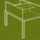
Double Faced Full Panel Carrel Table TB-4836-FP