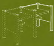
Single Faced Workstation initial/ladder TB-2836-WS-A TB-2848-WS-A