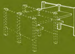
Double Faced Workstation initial/ladder TB-2836-DWS-A TB-2848-DWS-A