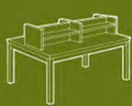
Double Faced, Double Tier Index Table TB-6060-ID