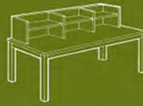
Single Faced, Double Tier Index Table TB-3090-ID