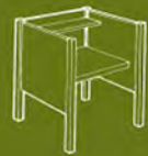
Single Faced Carrel TB-2436-SC TB-2448-SC