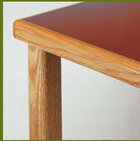
Teres R Series radiused edgeband