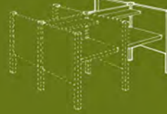
Double Faced Carrel initial/ladder TB-2436-DSC-A TB-2448-DSC-A